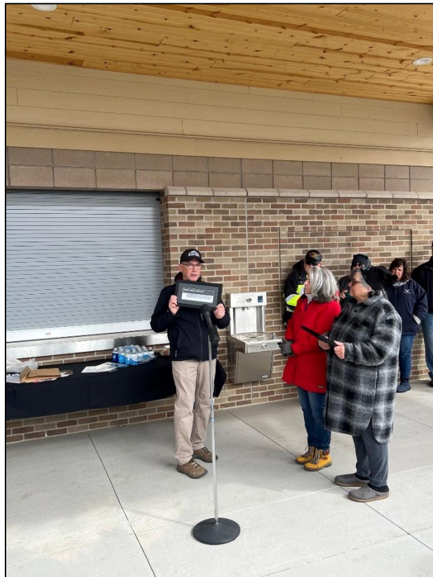
Presentation of Items to the Crockett Family