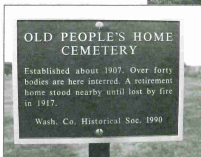
The Old People's Home cemetery, overlooking St. Paul Park, is now just a field. All headstones and monuments are gone. The WCHS placed the marker in 1990.

Cottage Grove residents interested in the Old People's Home and cemetery want to hear from anyone who may have heard of, or remembers, anything about the home and/or the cemetery. Please contact Cindy Yff at 651 558-6314 and help us tell as much of the story as we can uncover.