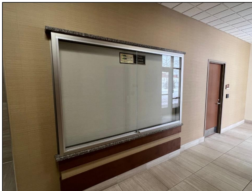
Training Room Display Case

Staff was tasked with the design and implementation of a historic preservation display case at City Hall. The display case to be utilized is located in the Training Room hallway as shown in the image below.