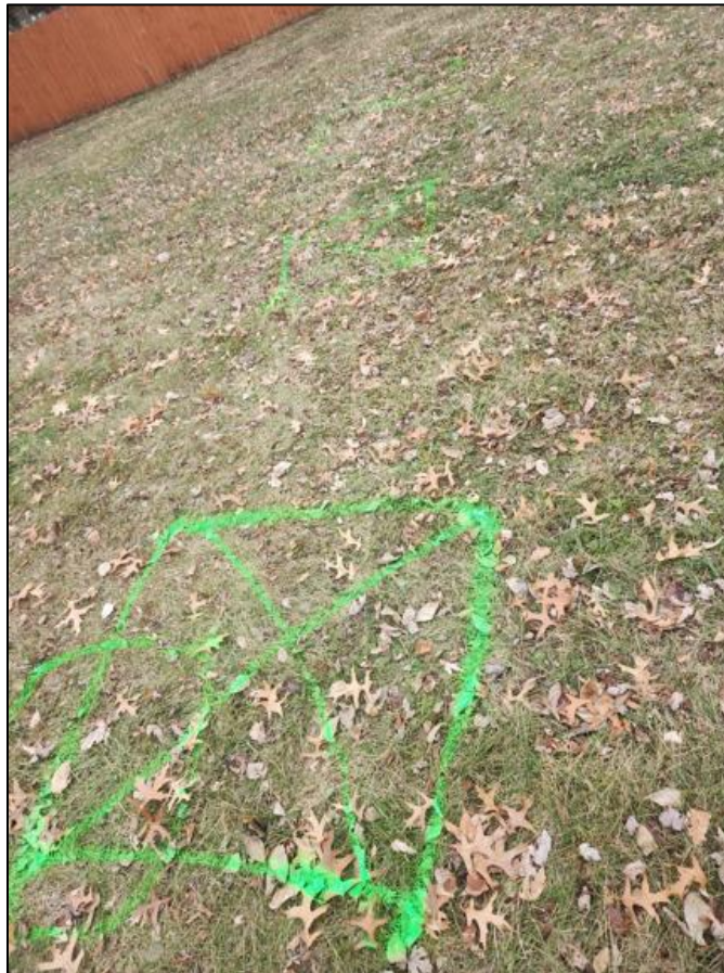
Potential Outhouse Locations

were additional dig spots found based on the metal detection system. Potential digging onsite would occur in early spring.