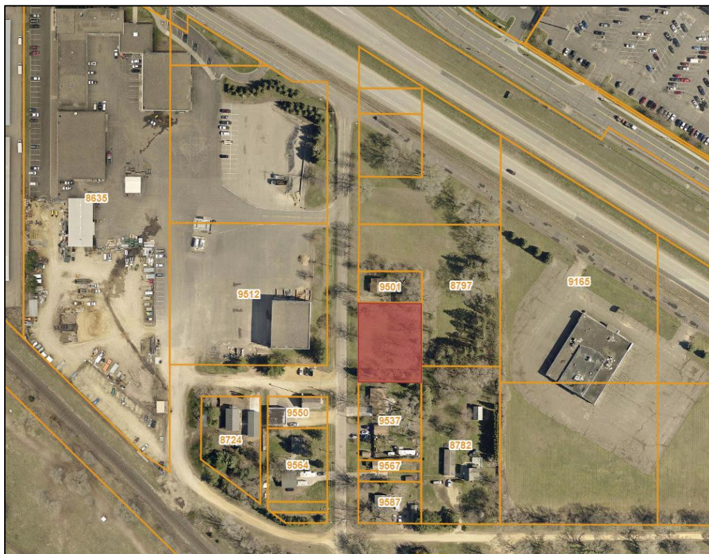
Subject Site Location